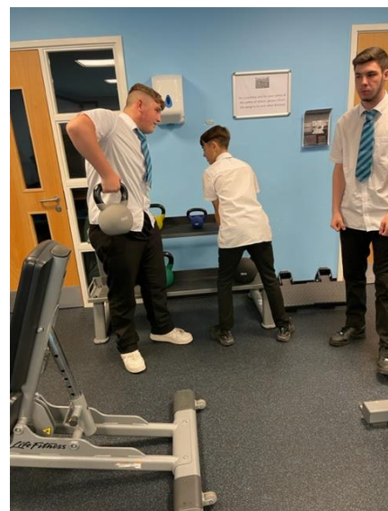
and the gym