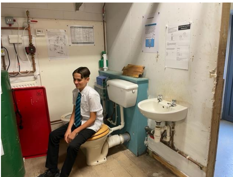
And we tried out the plumbing