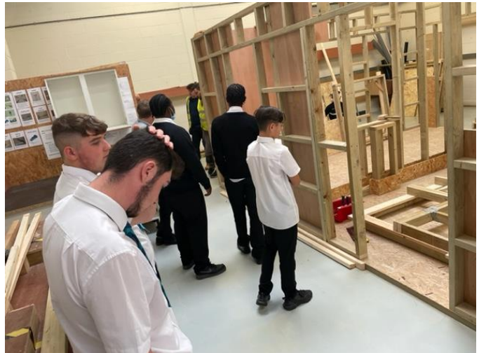
and the carpentry