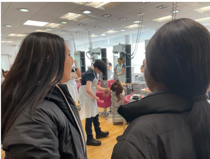
We visited the hair and beauty salon