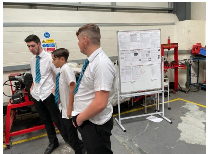
and the motor vehicle workshop