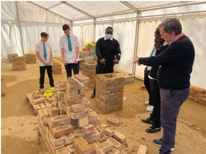
We checked out the brickwork

and beauty. Another option for Post 16 is 'T Levels'. The Health & Social Care hospital ward is under construction, so we look forward to seeing that next time.